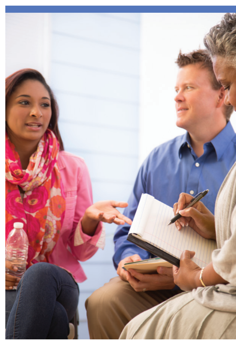
Reporting On | Smoking Cessation | May 2021

For more information about smoking cessation programs, counseling, support groups and NRT, please contact your health care provider.